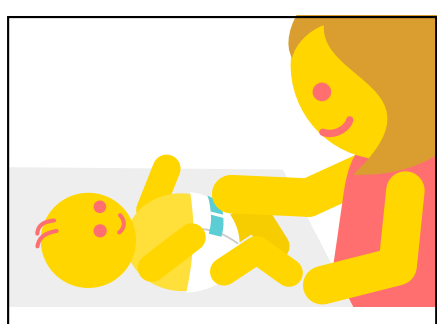
Step 7. Adjust the diaper for fit